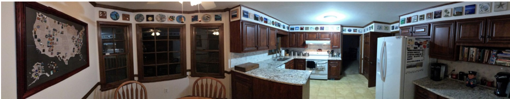
Kitchen Travel Wall Tiles and Travel Pins www.bobsuegregg.com