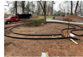
Front Yard and Path