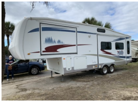
Cardinal Fifth Wheel