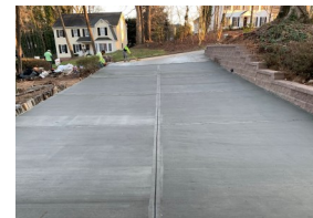
Driveway and Wall