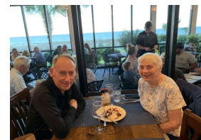
Sea Captain's House