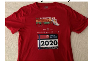
Peachtree 10K Shirt