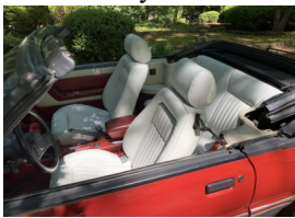
1988 Mustang GT